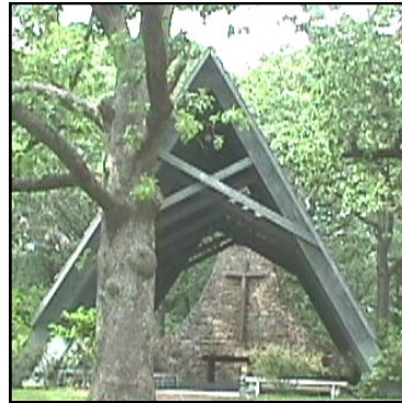
Tall Oaks Chapel

Located on 350 beautiful woodland acres, Tall Oaks is a camp, retreat and conference center two miles east of Linwood, Kansas (about 30 minutes from Saint Andrew). Check out the Tall Oaks website, talloaks.org , for more information.